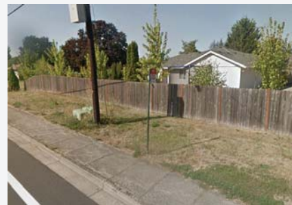
WHEATLAND RD @ RIDGECREST DR BUS STOP 1