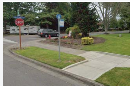
PARKMEADOW DR @ WHEATLAND RD 1